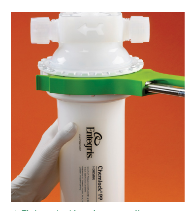
4. Tighten locking ring to easily seat double o-rings. Use a Chemlock integrated housing wrench to ensure proper tightening.