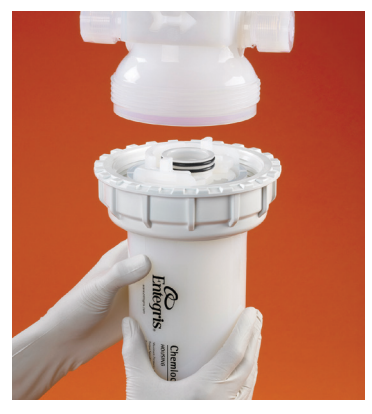
3. Attach head to bowl.

Please call your Regional Customer Service Center today to learn what Entegris can do for you. Visit www.entegris.com and select the Customer Service link for the center nearest you.