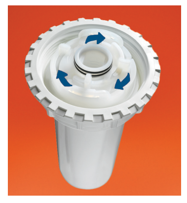
2. Twist filter 1/4" turn to lock.