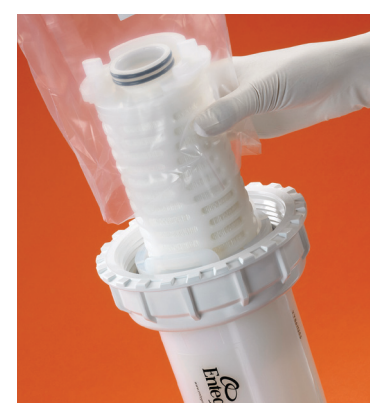
1. Insert cartridge into bowl.