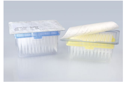
TipRack, sterile and non-sterile

Space-saving, environmentally-friendly refilling system for the TipBox. Each with 5 racks of 96 tips, including 1 TipBox. Sterile TipStacks are supplied with a transfer aid, in order to insert the rack into a previously autoclaved box without hand contact. Each packaging unit contains 2 TipStacks.