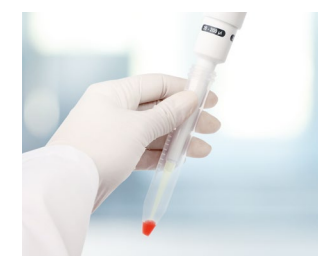
Narrow centrifuge tubes