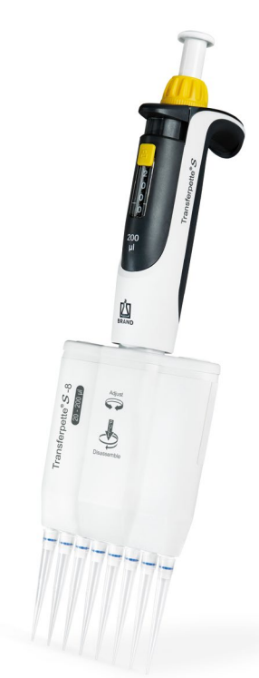
Transferpette® S – multi-channel

Five adjustable volume sizes range from 0.5 \mu l to 300 \mu l