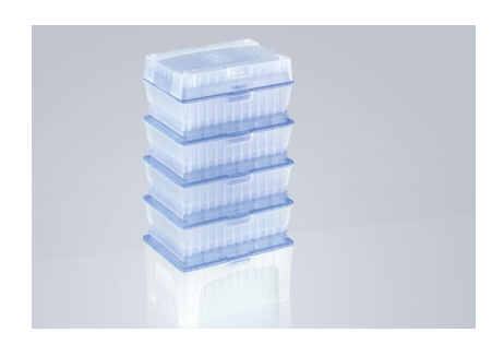
TipStack™ , sterile and non-sterile

Enables single-hand opening and closing. The clamp mechanism securely holds the tip tray in the box.